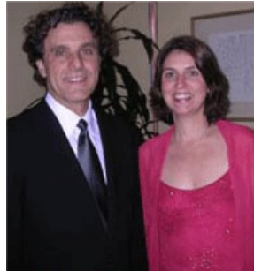
At the 2004 Grammy Awards, where we won for The Train They Call the City of New Orleans .