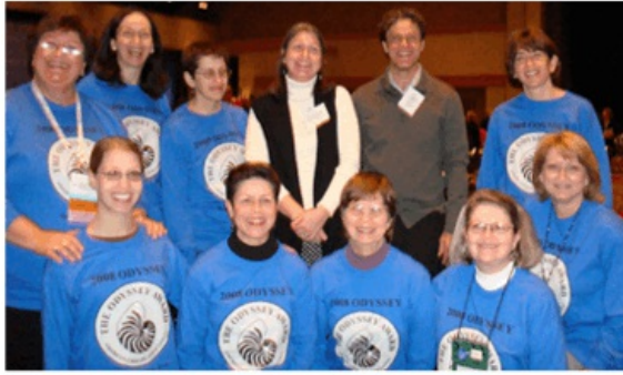
Meeting the Odyssey committee at the ALA convention in Anaheim